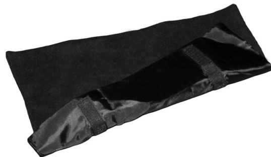
Fleece-Top Comfort Liner with Hook & Loop Fasteners.