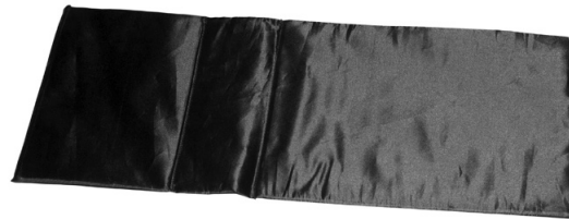
Reinforcement Board shown flat.

Step 2. Fold Reinforcement Board as shown in Figure A.